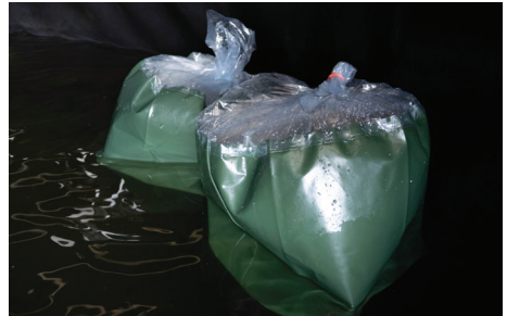
Transportation bags are placed on water surface to allow water temperature to equalise with reception tank.